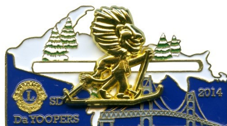
2014 White Sliding Bright Gold Lion