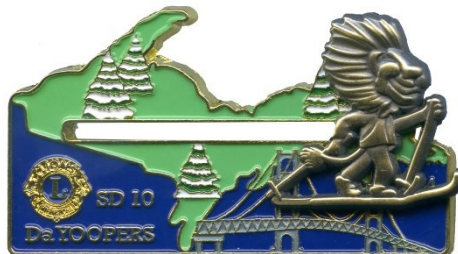
2014 Green Sliding Old Gold Lion