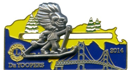
2014 Yellow Sliding Pewter Lion

NOTE: The blue, green, and red sliding Lions for 2014 are the regular issues and the purple, white, and yellow are special issues.