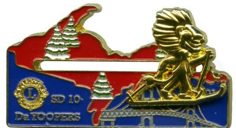
2014 Red Sliding Bright Gold Lion