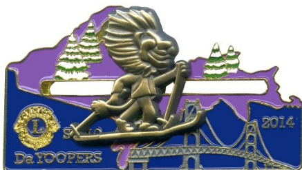
2014 Purple Sliding Old Gold Lion