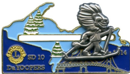
2014 Blue Sliding Pewter Lion

NOTE: The red, green, and blue sliding sleds with the Lion for 2013 are the regular issues and the purple, lime, and gray are special issues.